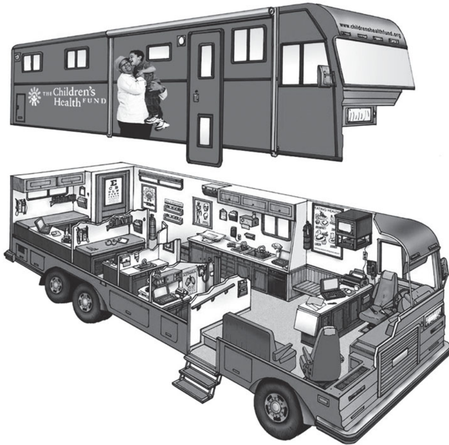
EXHIBIT 2 The CHF Medical Mobile Unit (MMU) Model