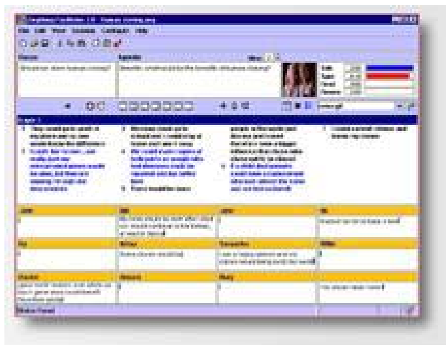
Figure 2. The interface of the Zing system online (top) or in face-to-face mode (lower). In each case the question for discussion are displayed at the top. The set of small windows that occupy the bottom half of the screen are each controlled by a participant who type in ideas and then transfer them to the central public area for all to see and discuss leading to more individual entries. This affords lively interaction between participants.